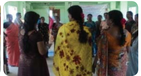
Pre education Learning material Distribution and Training Program