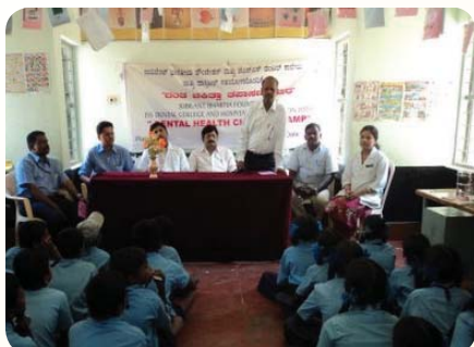
Dental Camp and Awareness session at Gajraula

Jubilant Bhartia Foundation has been working across four vital social issues namely Education, Health, Livelihood promotion & Trust building activities. As one of the most important initiatives for trust building in the surrounding community, it was felt that one of the most important members of our society i.e. the senior citizens were the most neglected ones and they deserved a degree of recognition and reward which they were deprived of. JBF scheduled the event again wherein 53 senior citizens of Hasanpur block as well as Gajraula block were felicitated which had been selected through participatory approach.