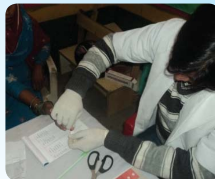
Hemoglobin checkup of expecting mother at Gajraula

After the baseline and primary visits, meetings with the farmers in three villages viz. Singhpur, Banakia and Narela were organised in the Kapsan