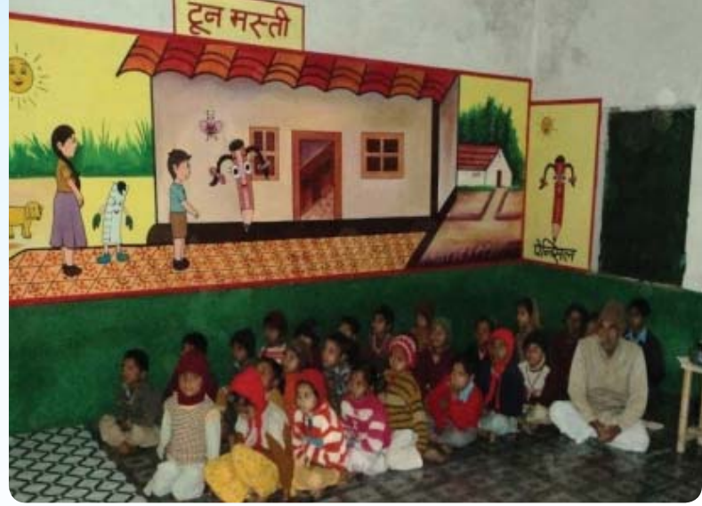
Toon Magic Program at a Glance