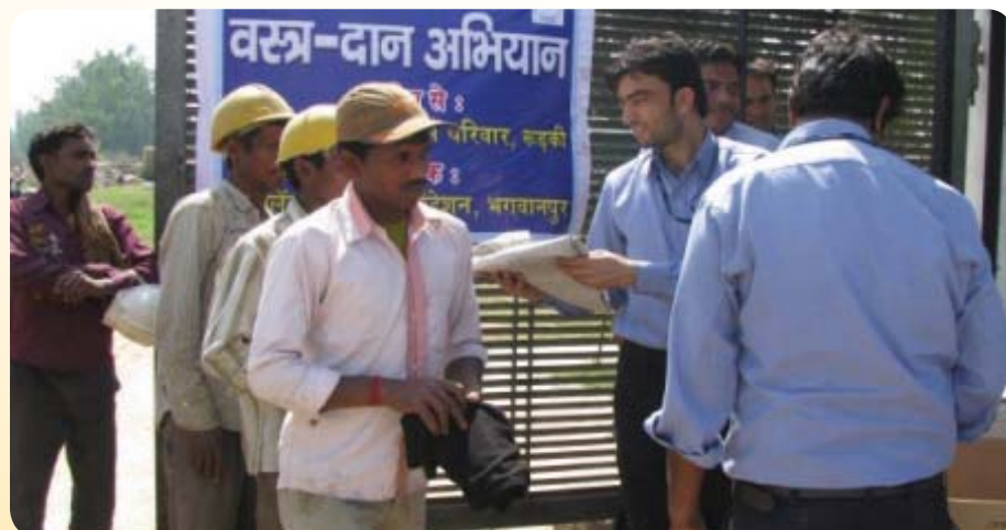
Vastra Daan Program at Roorkee

cold weather. The new and old but usable & wearable woolen clothes & rags were collected from Jubilant employees and distributed to the needy people.