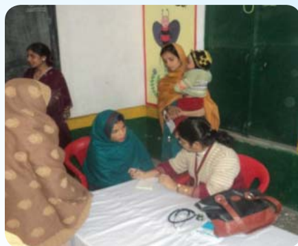
ANC Session at Gajraula in Progress

Farmers in the project villages, viz. Singhpur, Banakia and Narela, have been cultivating hybrid maize but their knowledge about the hybrid maize cultivation practices including quality seeds, sowing methods, sowing time, plant geometry and population, pest & disease management, balanced use of inputs has been rather superficial. Due to lack of awareness and knowledge about good agriculture practices their crop average yields were also low