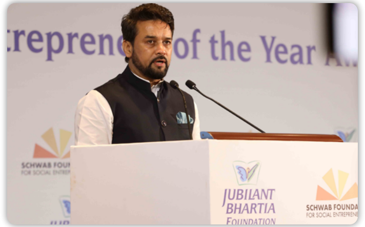
Anurag Singh Thakur, Union Minister for Information & Broadcasting and Minister for Youth Affairs & Sports, Government of India delivering his address