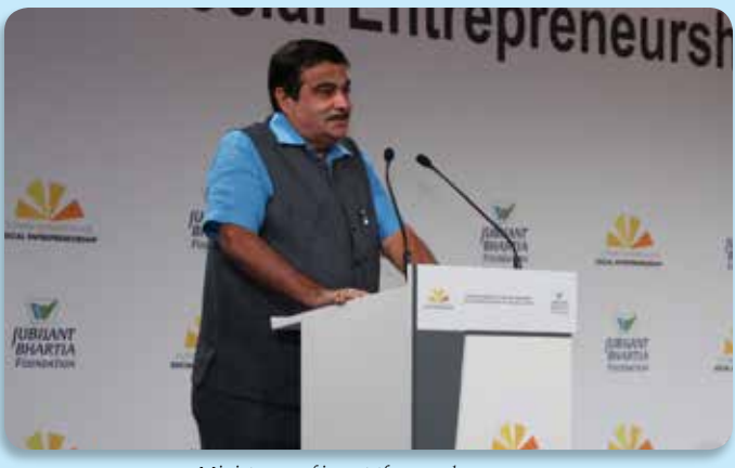
Minister speaking at the award ceremony