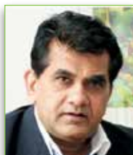
Mr Amitabh Kant

Board Member, Jubilant Life Sciences Ltd Former Member Secretary, Planning Commission Government of India