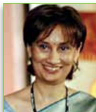
Ms Shobhana Bhartia

Co-Founder & Chairperson, Schwab Foundation for Social Entrepreneurship