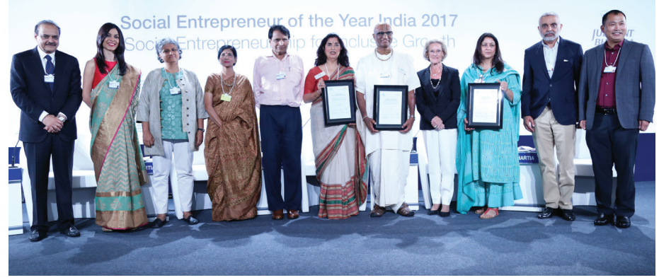
Social Entrepreneur of the Year Award Ceremony

"This year's 3 finalists are all working to address different aspects of the education ecosystem – mid-day meals to help students focus in school, increasing girls' enrolment in marginalized areas, and helping to change attitudes and culture around gender roles through schools. Our three finalists are operating at significant scale across India, pioneering advances in technology, community engagement, and learning methodology to build a