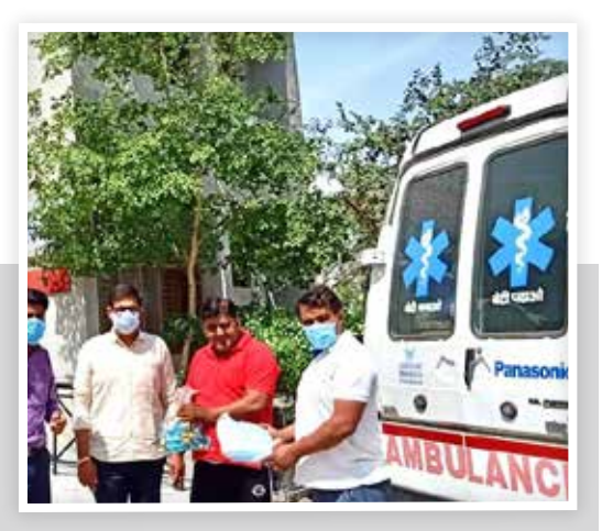
Mask and Sanitizer Distribution at Jhajjar