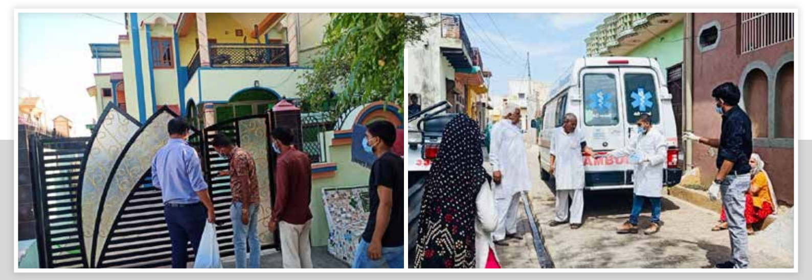
Masks, Soaps and Sanitizers Distributed among the Community at Bharuch

• Through mobile ambulance, telephone calls and awareness in small groups on COVID-19 information will be spread to all citizens.