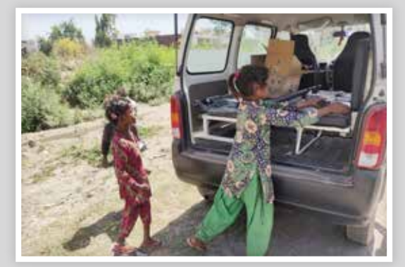
Cooked Meal for Migrant Workers in Gajraula