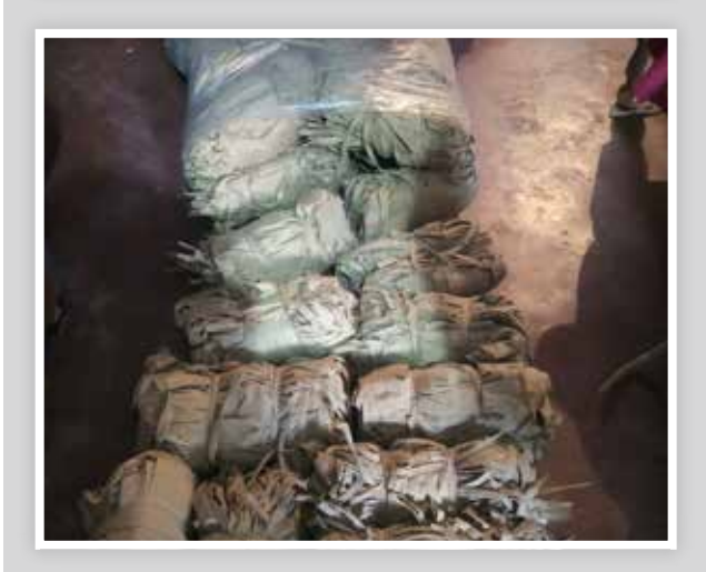
Stitching of Cotton Masks is in Progress at Various Locations