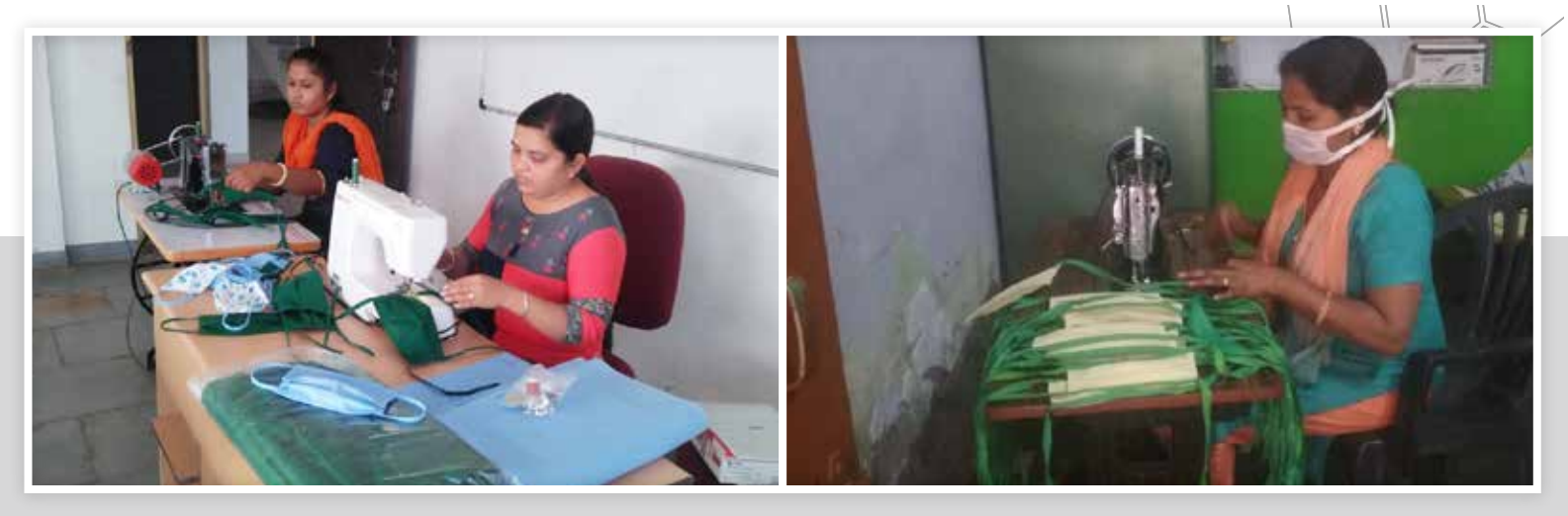
Women at Work, Stitching Masks for JBF for Further Give Away to Community & Employees